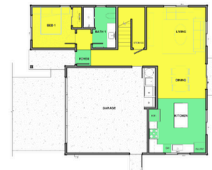
1 E - FLOOR PLAN - LEVEL 1 1/8" = 1'-0"