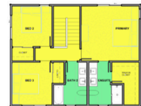
1 E - FLOOR PLAN - LEVEL 2 1/8" = 1'-0"